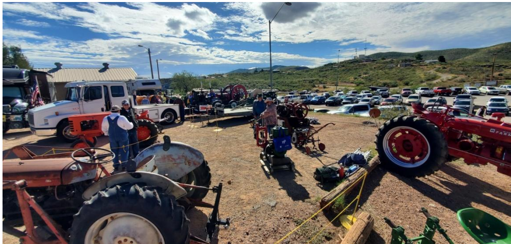
Helldorado Days 2022