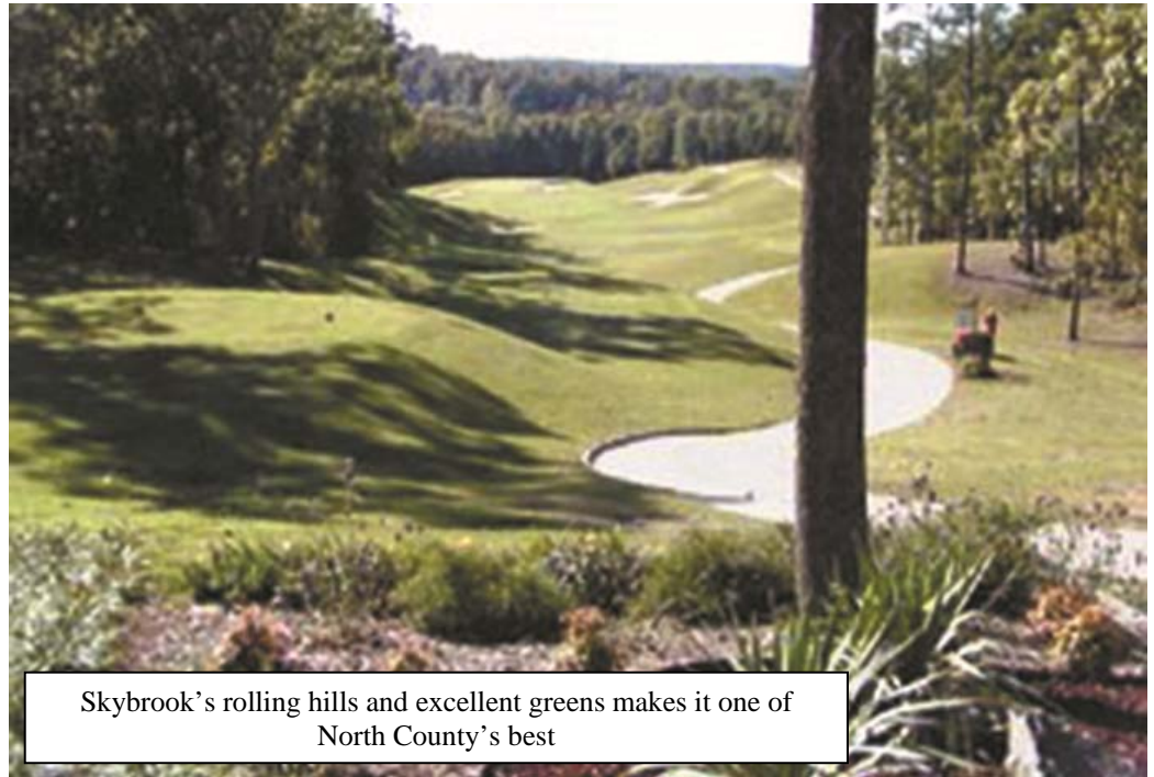
Skybrook's rolling hills and excellent greens makes it one of North County's best

For “the down the middle” hitters, all these elevated tees could lead to red numbers. But, for errant drivers, it could create some tense moments. Hole #6 aside, off the tee box, this course can be forgiving because many of the holes slope back towards the fairways, a uniqueness of this course that sets it apart. If you miss a shot, you won't be looking for your ball longer than the rules allow.