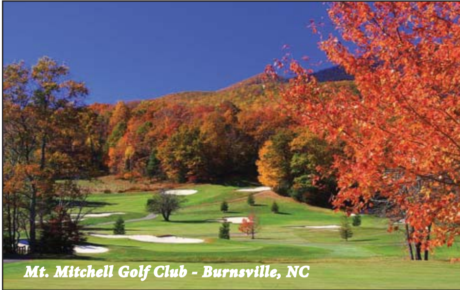
Mt. Mitchell Golf Club - Burnsville, NC