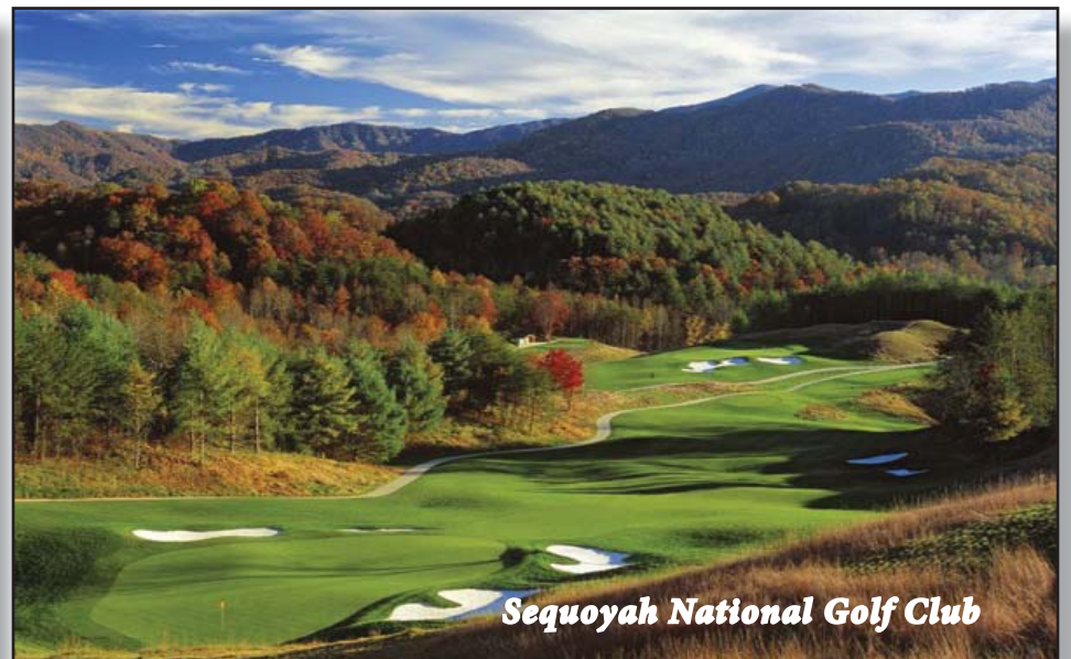
Sequoyah National Golf Club