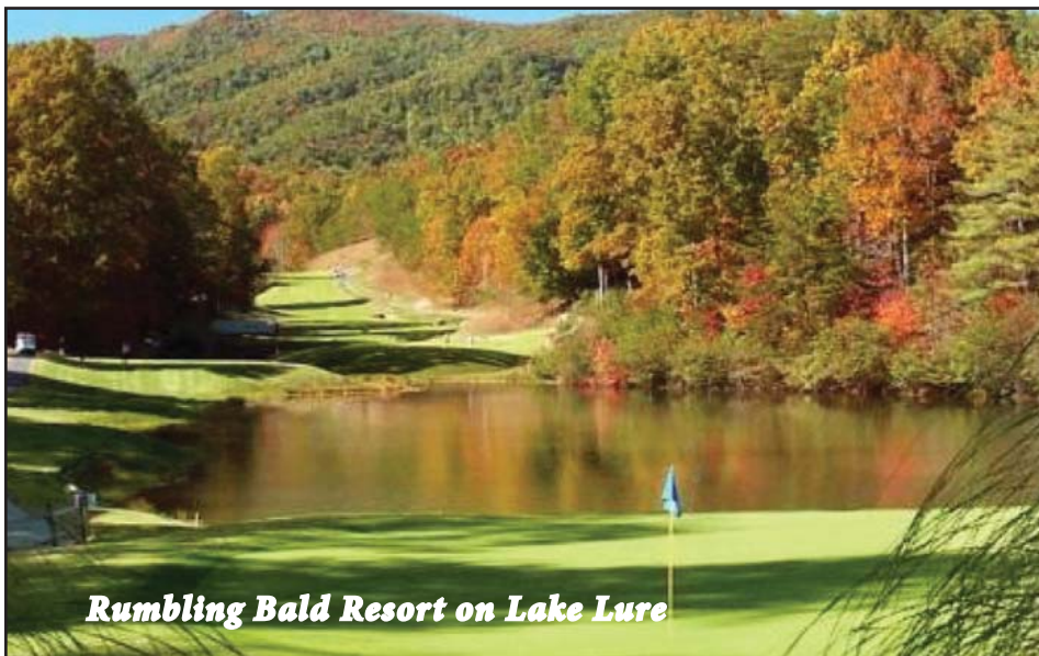
Rumbling Bald Resort on Lake Lure

September 22nd marked the first official day of fall, so daydream a bit and celebrate the changing of the leaves on courses close to home. Wherever you are, don't delay in squeezing in those last rounds of fall. As the Game of Thrones warns: Winter is coming. A white golf course just doesn't look the same.