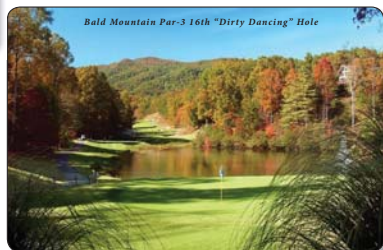
Bald Mountain Par-3 16th "Dirty Dancing" Hole

The Apple Valley Golf Course, in contrast, is a traditional design that Maples delicately routed through the hills and dales just south of Bald Mountain. Maples estimates that nearly three-fourths of all shots on Apple Valley are either level or downhill, a rarity for a course in these parts.