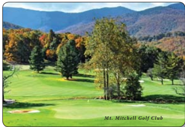
Mt. Mitchell Golf Club

Come and play America's newest golf trail and find out why millions of travelers have visited the Blue Ridge Parkway. When you return home from playing the Blue Ridge Parkway Golf Trail, you can tell your friends you played golf "up in the clouds."