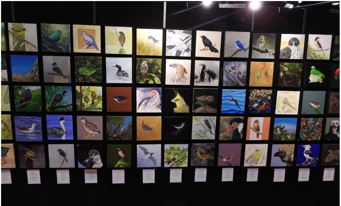
678 artworks of birds in global danger of extinction were presented along 33 meters, and in the future it will be exhibited in Israel