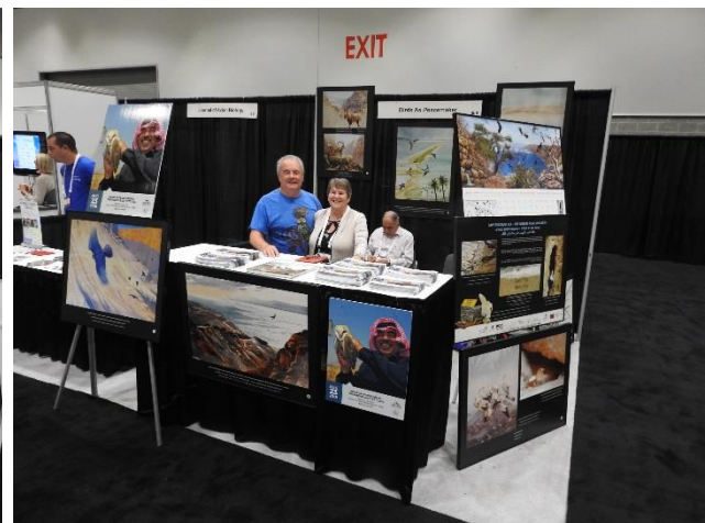
Our booth for selling the Dead Sea book and presenting the regional activities in the Middle East; in the front the Canadian volunteers with artwork from the Dead Sea exhibition also exhibited in the Israeli Parliament (Knesset)