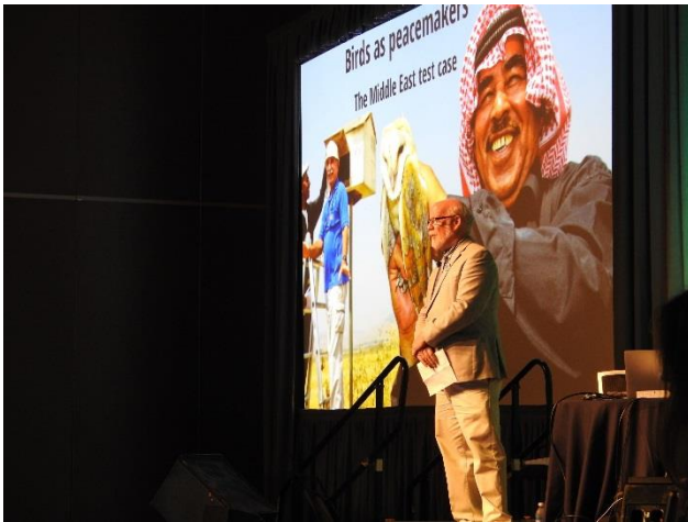
Dr. Richard Cannings, Canadian Member of Parliament, who has written 15 books, convened the event