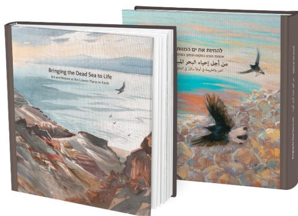
Dead Sea book covers