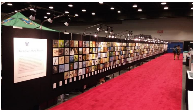
678 bird species in danger of extinction globally were painted by 96 artists, and presented in a 100 feet (33 meter) long mural, aimed at raising awareness to nature conservation, initiated by the organization Artists for Conservation