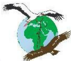
The International Center for the Study of Bird Migration, Latrun