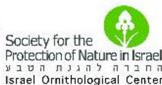
Society for the Protection of Nature in Israel החברה להגנת הטבע Israel Ornithological Center