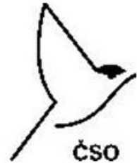
Czech Society for Ornithology