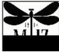
Museum & Institute of Zoology Polish Academy of Science