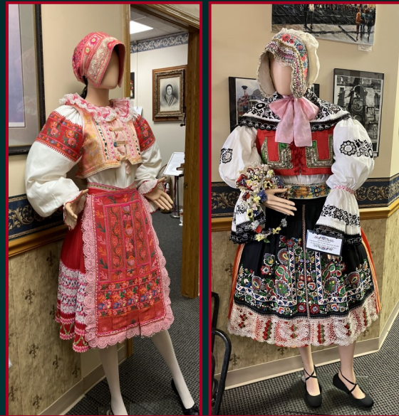
Slovak & Czech Kroj