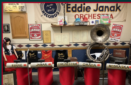
The Music Room