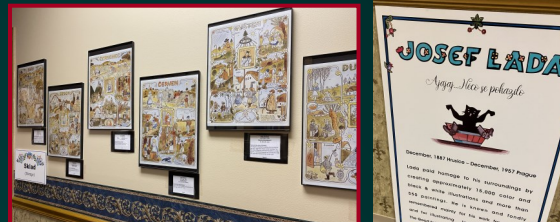
Josef Lada Art