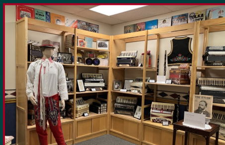
The Accordion Wall