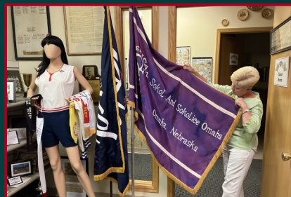
The Sokol Room