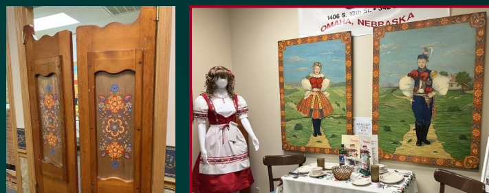
The Bohemian Cafe