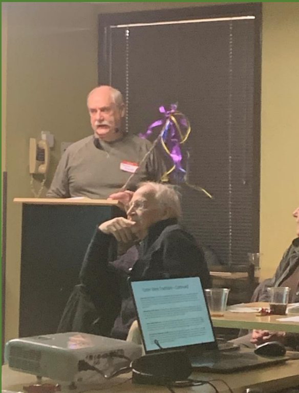
Discussing Czech Easter Traditions