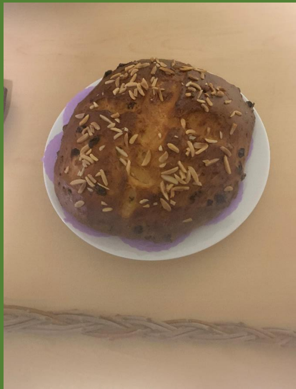
Easter bread "Mazanec"