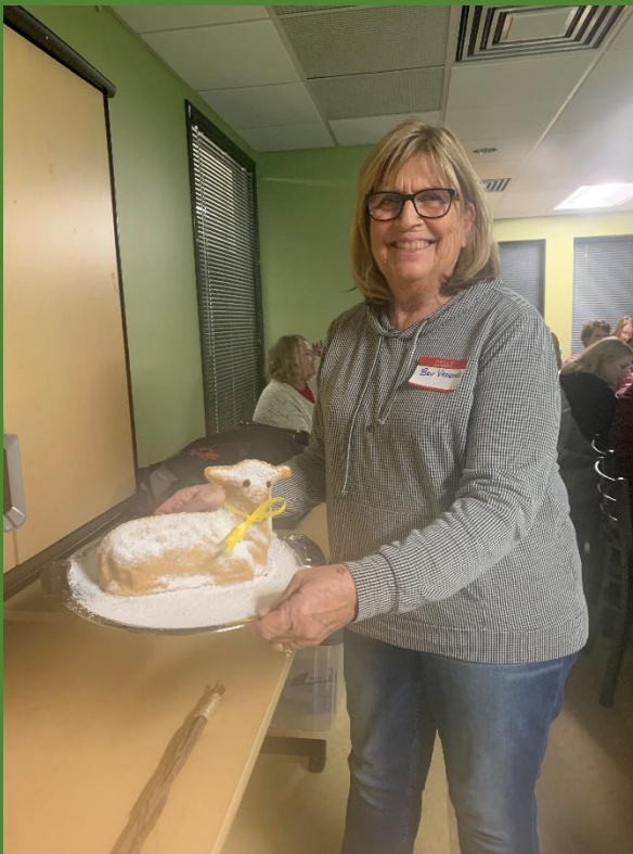
Lamb (Shaped) Cake