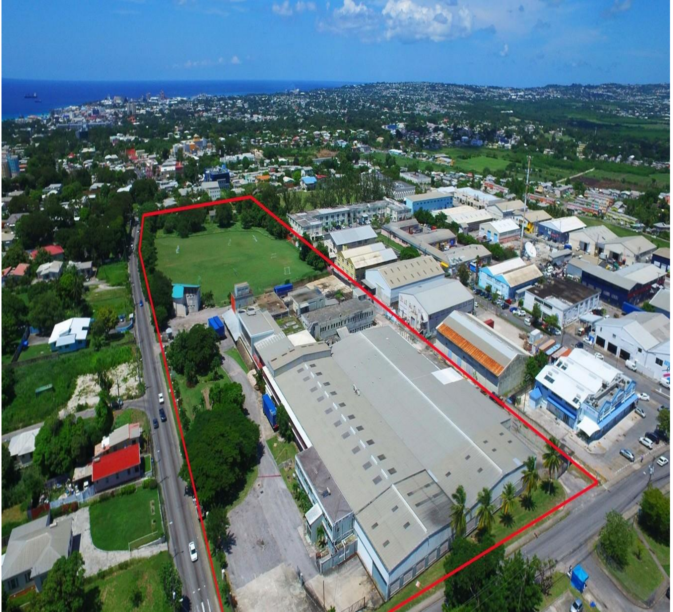
< A photo showing the outside view of the property we are going to acquire >