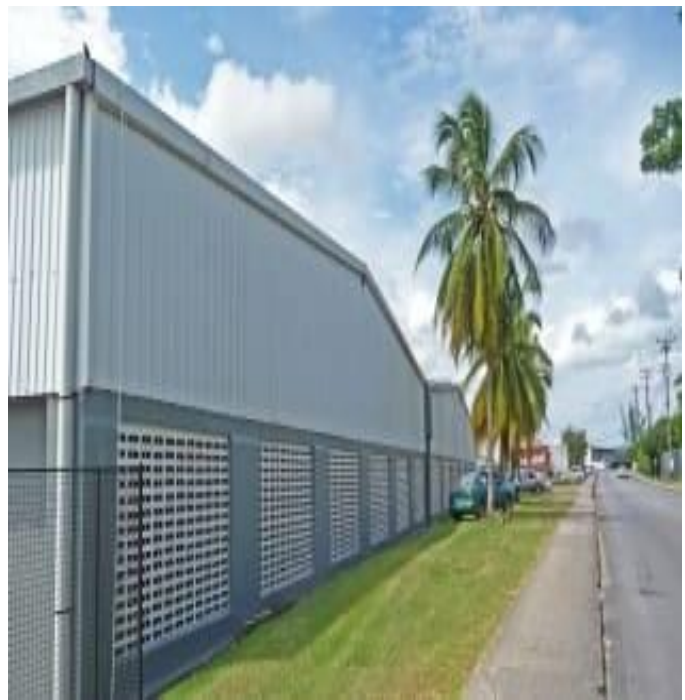
< A photo showing the side views of the property we are going to acquire >