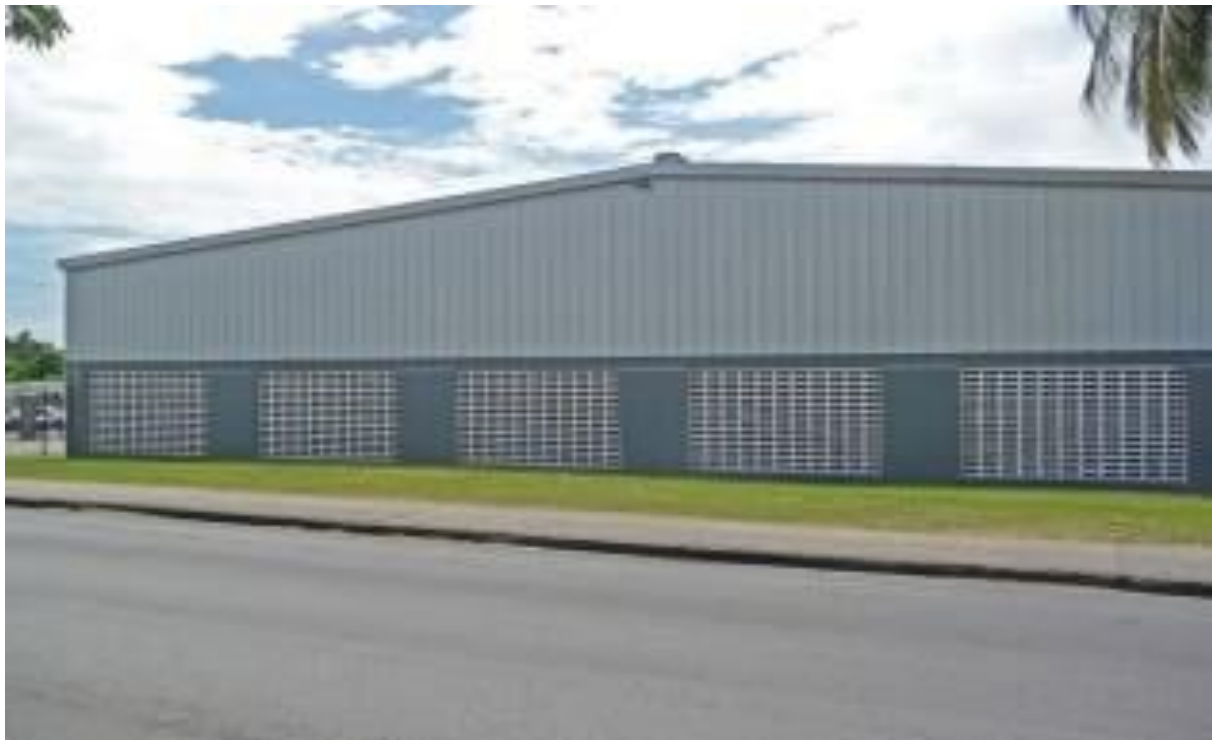
< A photo showing the side views of the property we are going to acquire >