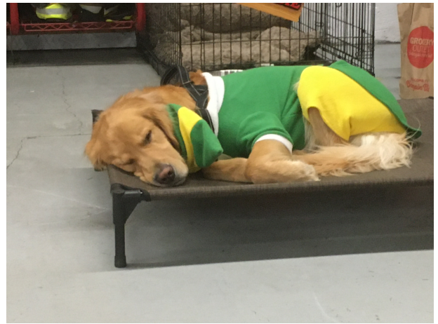
Barney: "My owner did say I was a comfort dog "