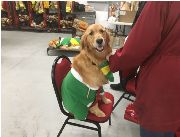
Probie, all smiles for the guests at the breakfast

Merry Christmas and Happy New Year from the Sublimity Volunteer Firefighters Comfort K-9 Team. Probie and Barney greeted young and old alike at the Department's annual biscuits and gravy breakfast.