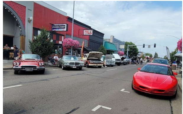
A variety of years, makes, and models, made this quite interesting.