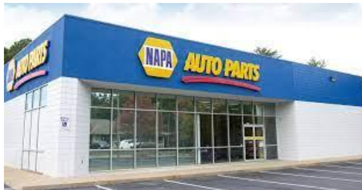
LAWRENCES AUTO PARTS INC.