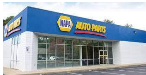
Lawrence's Napa Auto Parts South Salem