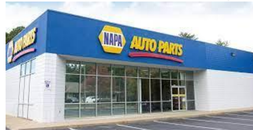
Lawrence's Napa Auto Parts South Salem