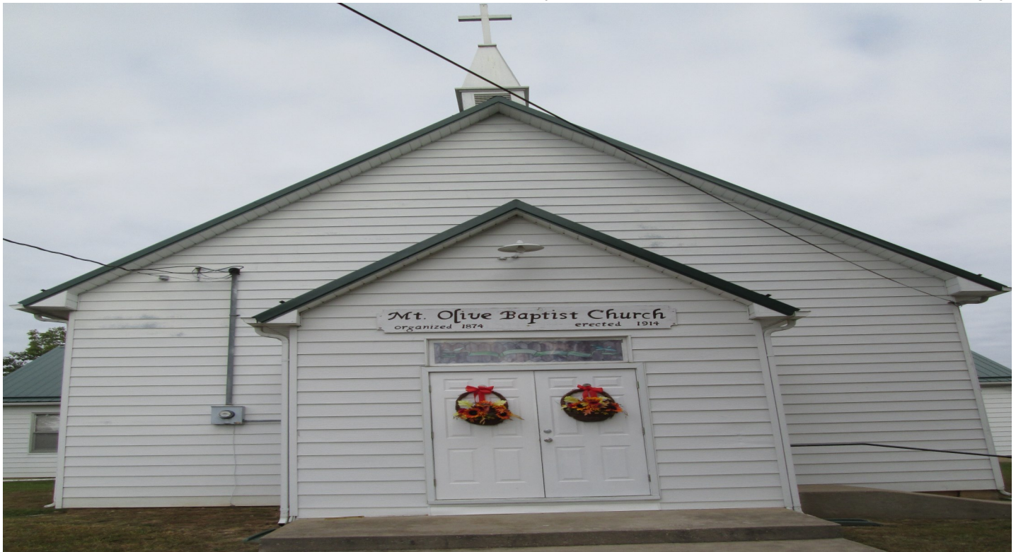
Mt. Olive Baptist Church Anniversary 1874