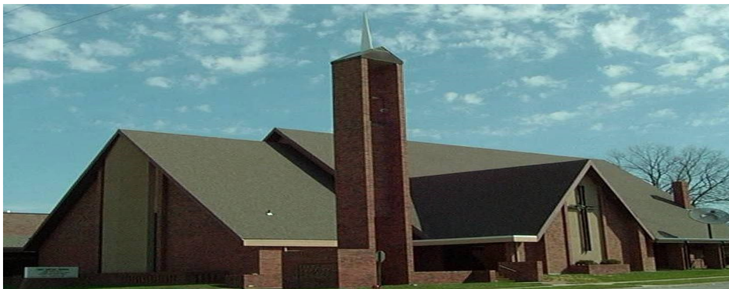
First Baptist Church, Sedalia Anniversary 1965