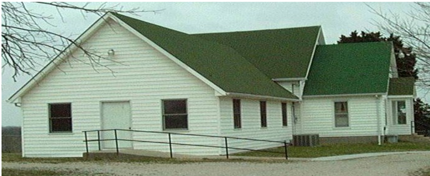
Mt. Herman, Anniversary 1887