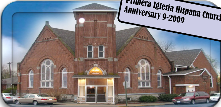
Primera Iglesia Hispana Church Anniversary 9-2009