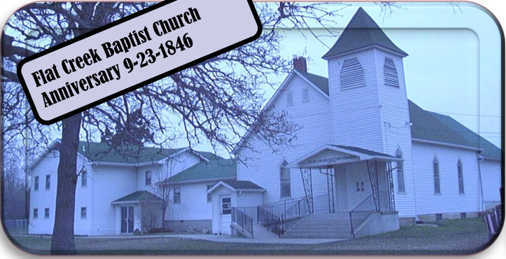
Flat Creek Baptist Church Anniversary 9-23-1846