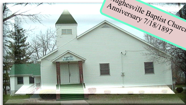
Hughesville Baptist Church Anniversary 7/18/1897