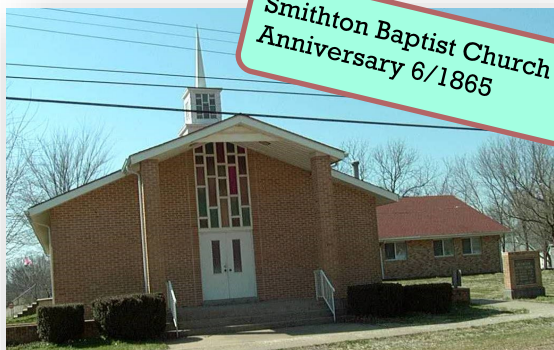
Smithton Baptist Church Anniversary 6/1865