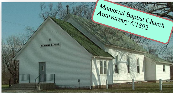
Memorial Baptist Church Anniversary 6/1892

Pastor/Staff lunch set for June 14, 2021 has been canceled.