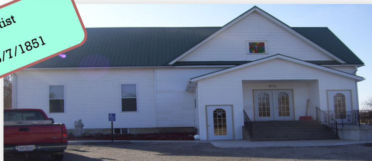
Bethlehem Baptist Church Anniversary 6/7/1851

Pastor/Staff lunch set for June 14, 2021 has been canceled.