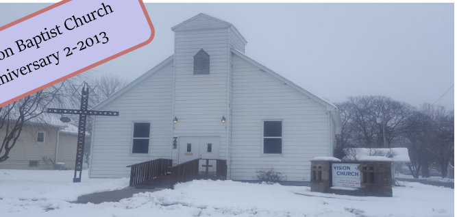
Vision Baptist Church Anniversary 2-2013

Help Wanted - Administrative Assistant for Calvary Baptist Church, Sedalia. High School graduate. Must be a person of faith in good standing with their church. Proficient computer skills with the ability to use Microsoft office. Excellent phone skills with a pleasant personality. 28 hours per week, Monday - Thursday at a complete hourly compensation, paid bi-weekly. Resumes may be sent to pastordonsatterwhite@gmail.com or Calvary Baptist Church 1015 W. 16th St. Sedalia, MO 65301.