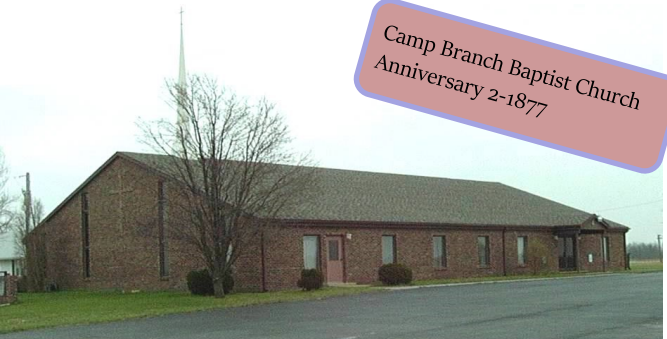
Camp Branch Baptist Church Anniversary 2-1877

Project Parachute: Our next meeting will be on February 18, 2010. at HBA Office, 5:00pm. Come and join us. You will be gladly welcomed. We will be discussing the theme for the Easter Box. If you have a friend or family member serving overseas we could send a box to them. Give us their name and address and we can send them a box.