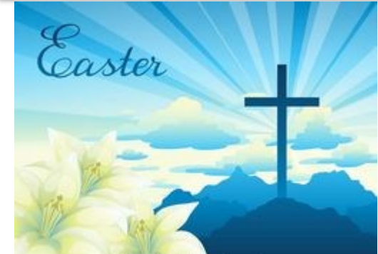
Easter is coming. Are you ready?