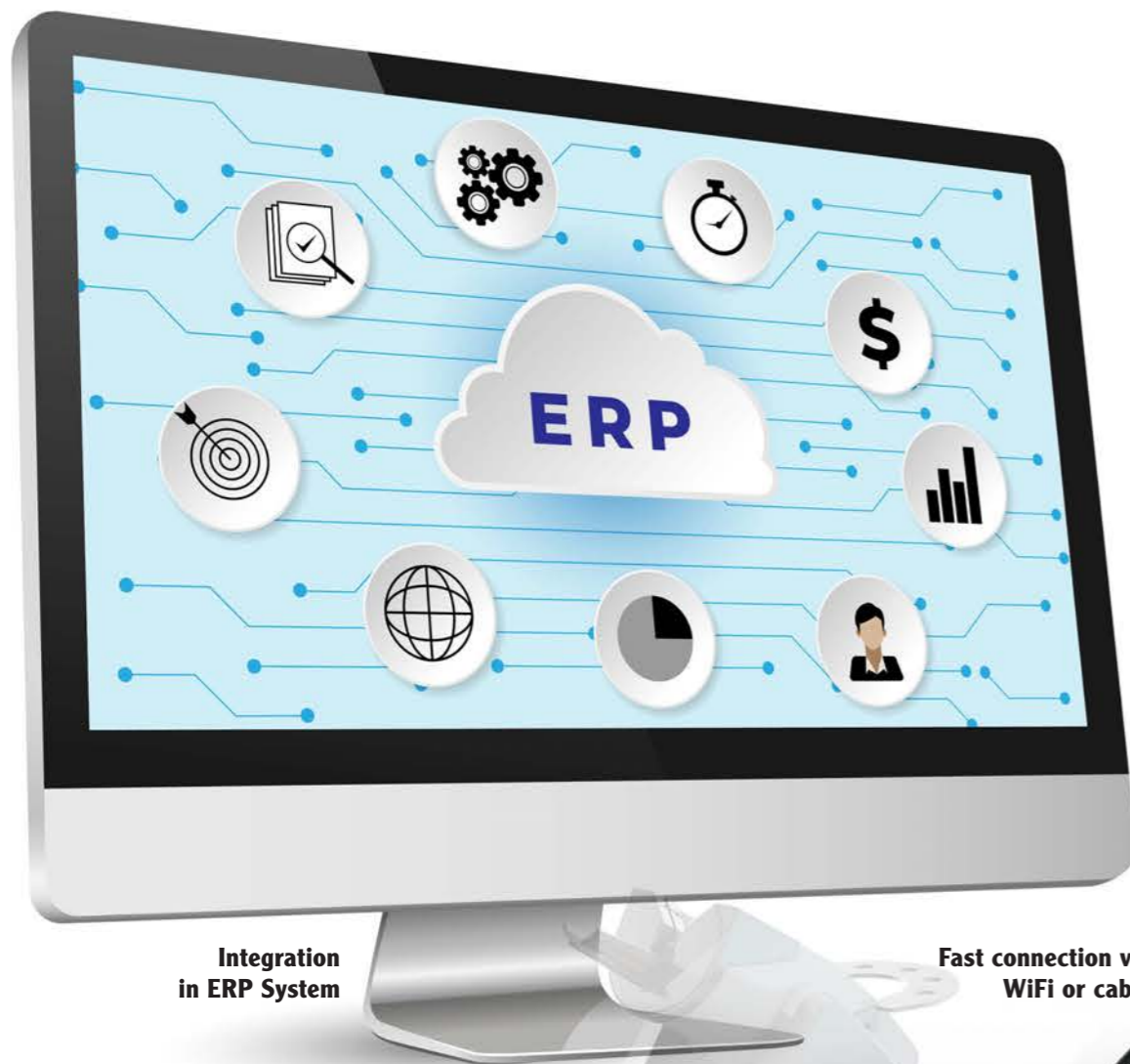
Integration in ERP System

Maximum connectivity, supporting IoT standards for full traceability with mobile-enabled, easy remote-control access.