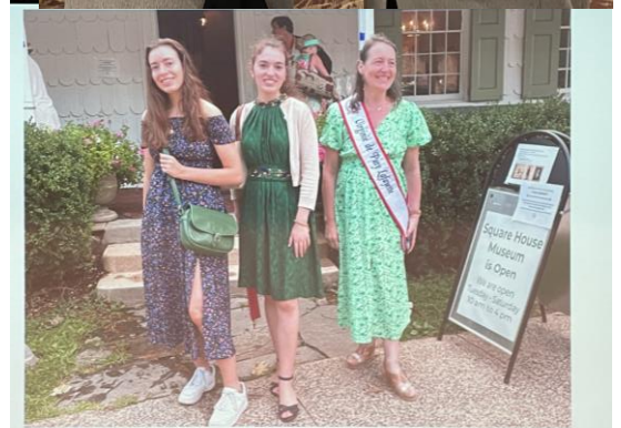
Lafayette's 8 th and 9 th great-granddaughters