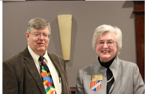
Left: Presentation of the Famous PACMOAA Mug