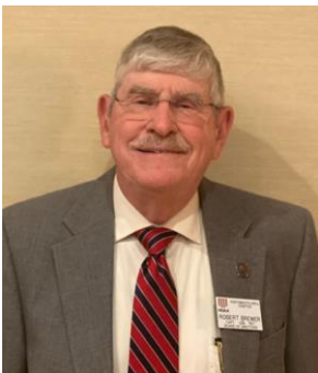
Submitted by CAPT Bob Brewer, USN (Ret) Chaplin

Be still and know God loves you. Be still and know God is always there. Be still and know God provides peace. Be Still and know God will guide you. Be still and know God “what is impossible with men is possible in God” (Luke 18:27)