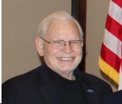
Submitted by: COL Hal Hostetler, USA (Ret)