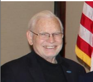
Submitted by: COL Hal Hostetler, USA (Ret)