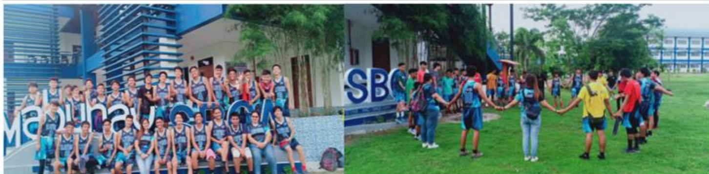
The entire team held hands for a prayer before going to the battle.

“I can do all things through Christ who gives me strength.” Philippians 4:13