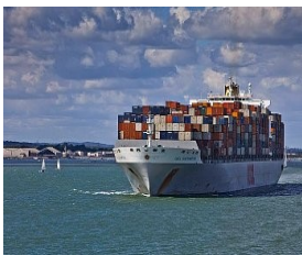
Merchandise containers Exports

Working from detailed plans, schedules and utilizing many other tools, enables us to have a clear focus and thorough understanding of what the risks and issues are.