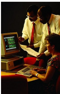
IT Project Team Performing Analysis

Whitaker & Associates, LLC is a multi-line consulting firm performing professional services in several markets listed by standard industry code and category .