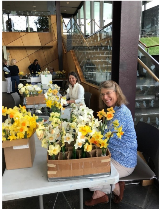
Prepping the blooms – photo by J. Minch

• MDS Show April 24 – 25, 2019 • Vollmer Center at Cylburn Arboretum