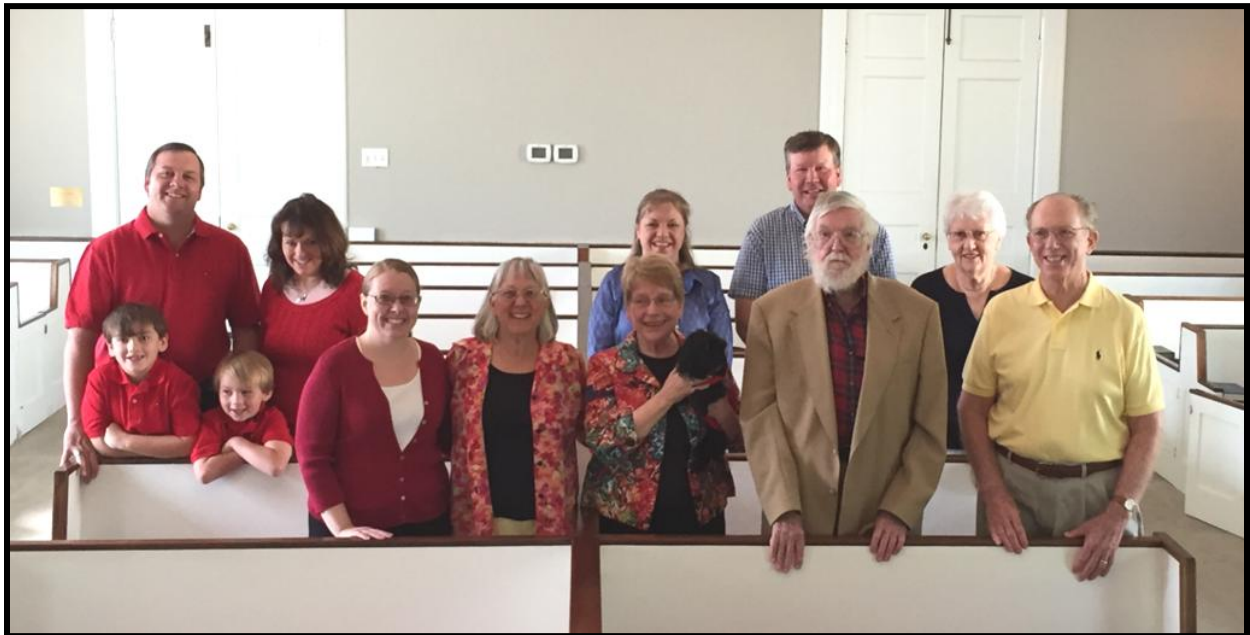
MPC Church Picture taken on Pentecost Sunday

Editor's Note: Members of MPC are welcome to join NMPC for any of the special events described in the newsletter.