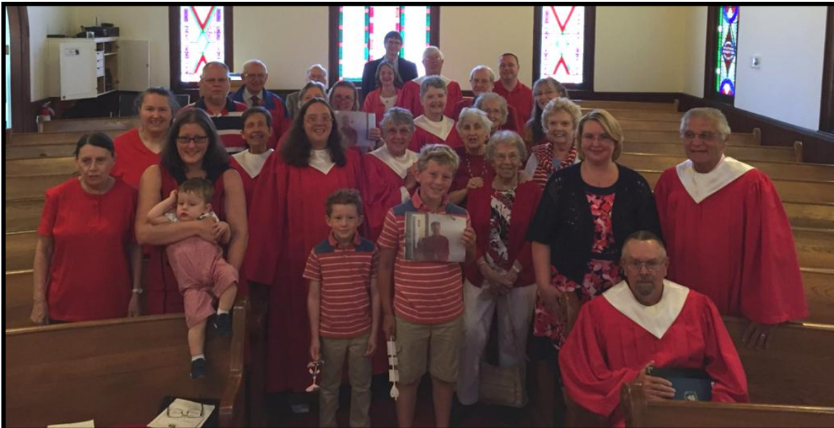
NMPC Church Picture taken on Pentecost Sunday