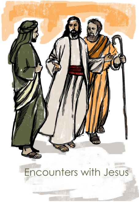
Encounters with Jesus