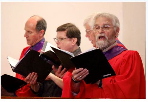
Guitar service at NMPC