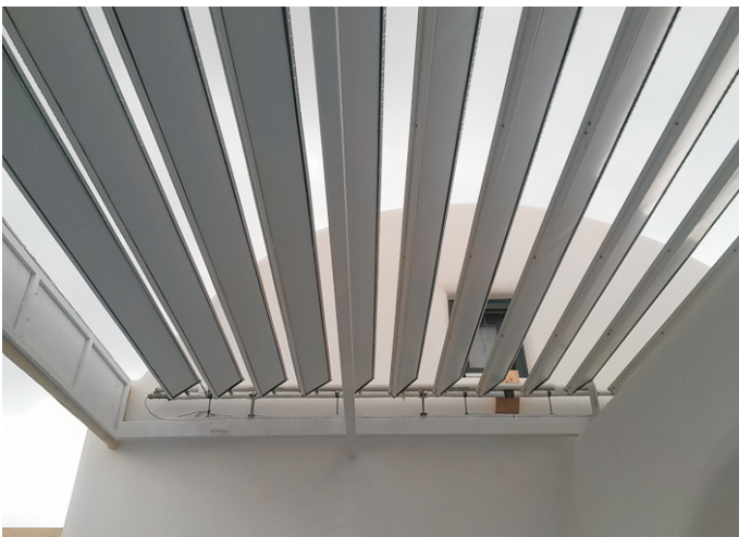
4 x 16 Panels are incorporated to the classical architecture in between the houses without any aesthetic disturbances