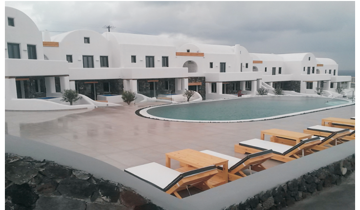
Hotel resort building with Energy classification (B+)

A 20-room Eco resort with floor-heating and floor-cooling systems, FanCoils, 300 L boiler, 4 pergolas with each 16 thermopanel Tp4 movable in East to West direction with solar tracker and motorized tilting flap mechanism, 6 kW heat-pump a/w and 17 heated Yacousi.