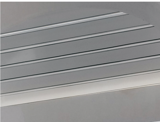
Panels have a smooth and clean underside which can be delivered in any preferable color combination.