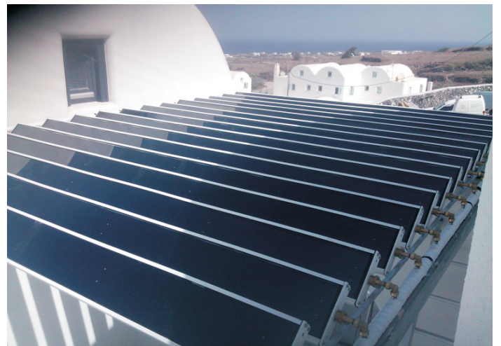
Panels are connected to the East to West tilt-mechanism, which is hardly visible, moving the panels +/- 60'.