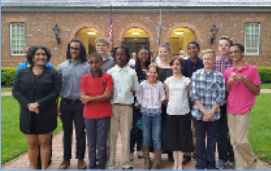
Academy students posing in front of York Hall after presenting at a Board of Supervisor's Meeting.

The York County Youth Leadership Academy is a community-based, 12-week program that develops leadership qualities in middle school youth. The primary focus is assisting youth who need additional supports and opportunities to be successful. Participants must reside in York County.