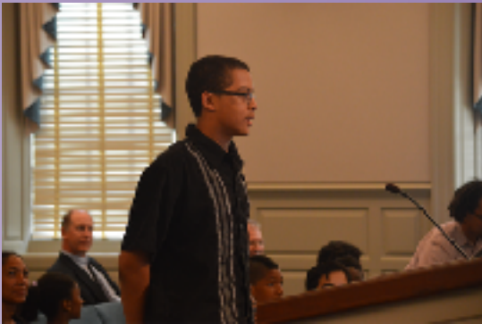
Academy participant speaking at a York County Board of Supervisors Meeting

Youth Leadership Academy is sponsored by the York County Volunteer Association