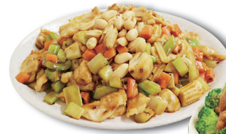
Kung Po Chicken