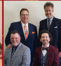
PORT CITY QUARTET