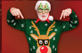
UGLY SWEATER NIGHT