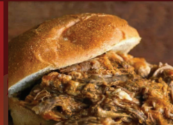
TONY'S BBQ NIGHT