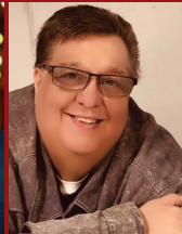
BIG MO & FAMILY