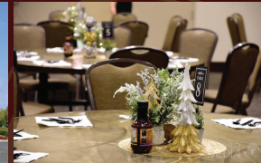
TRADITIONAL CHRISTMAS FEAST