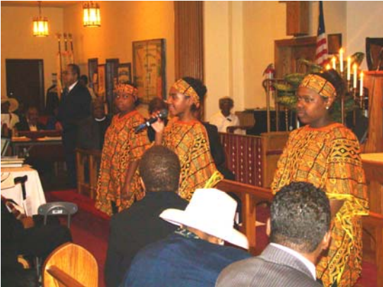
Liturgical Dance Ministry of Mt. Pisgah AMEC, Phila., PA.