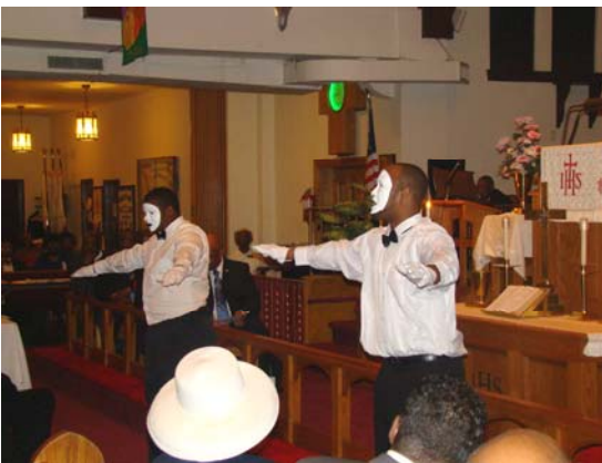
The Ultimate Praise Mime Ministry .Mt. Tabor A.M.E. Church, Philadelphia, PA