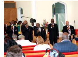
Guests Singers: The Pine Forge Harmonaires Male Acapella Ensemble