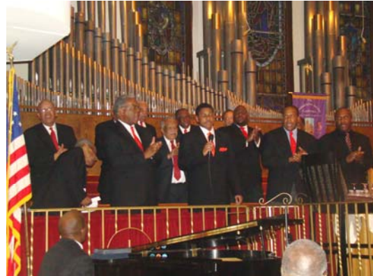
Male Chorus: Bethel AMEC, Bryn Mawr, PA