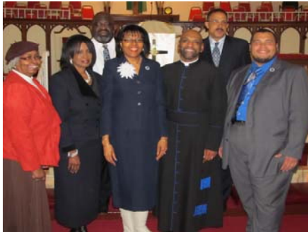
LAY AND CLERGY – WORKING TOGETHER