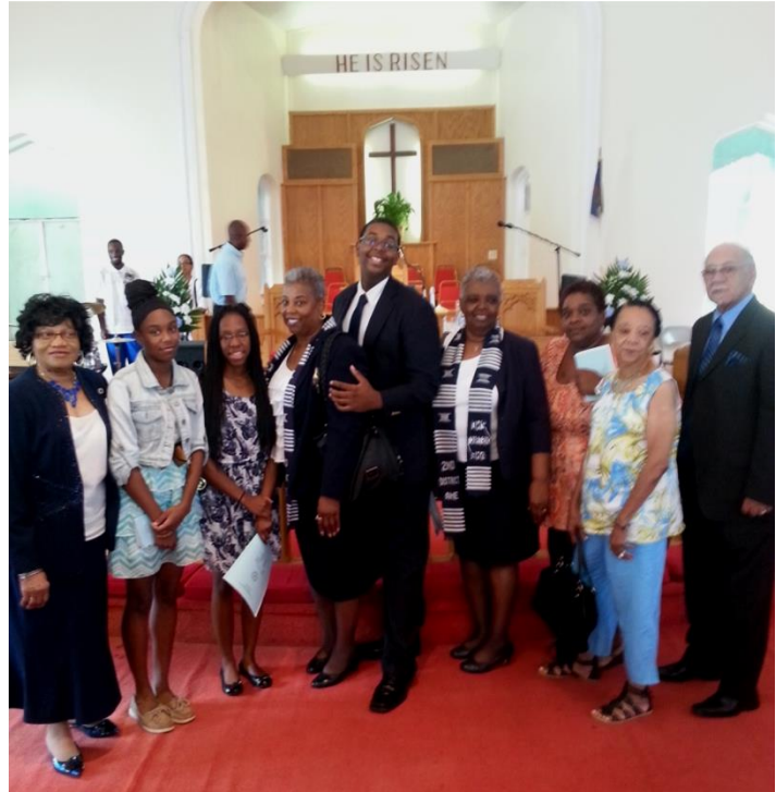
Theme "Laity Fulfilling the Great Commission."