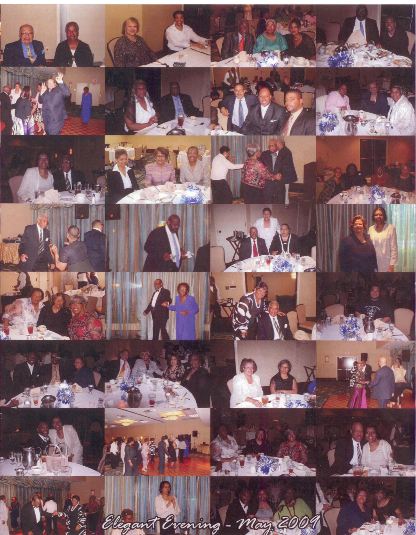
Elegant Evening - May 2009