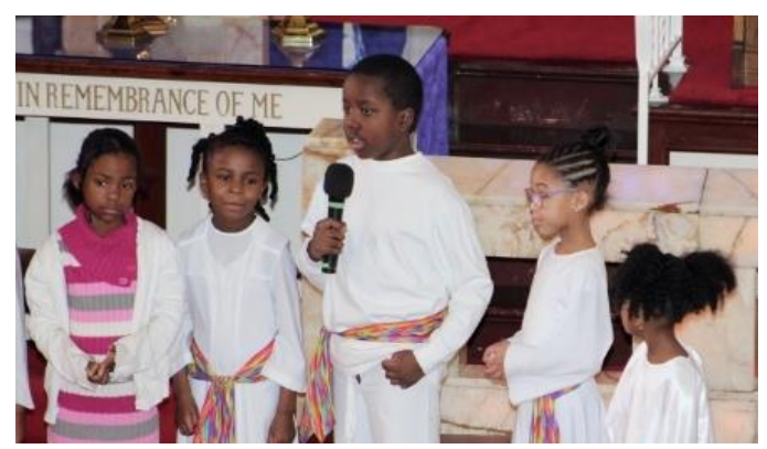
read the scripture: 2 Timothy 4:1-8.

We cannot forget our youth. They were part of the worship service and are tomorrow's leaders.