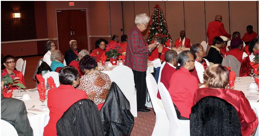
Anticipation and joyous expectations filled the air as members and friends filled the elegantly bedecked dining room