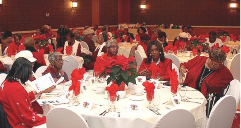
Anticipation and joyous expectations permeated the air as members and friends filled the elegantly bedecked dining room.