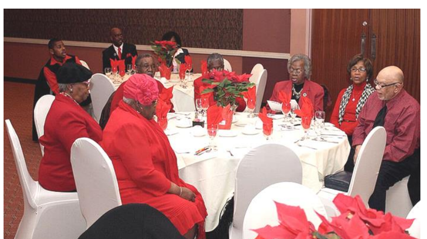
The color "RED" pervaded throughout the room