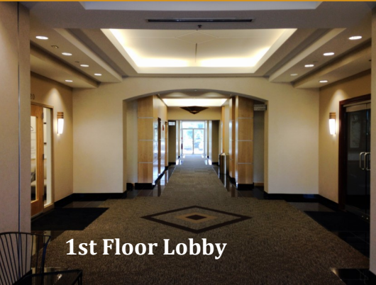
1st Floor Lobby