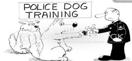
"Try as he might, Rex could not master the freemason handshake."