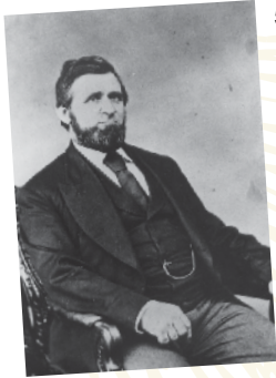
Oliver H. Kelley National Grange Founder

In 1867 the National Grange became the first nationwide farm organization. It is the first national organization to give full voice and vote to women,