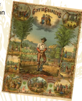
Historic Grange Poster from the Reconstructive Period