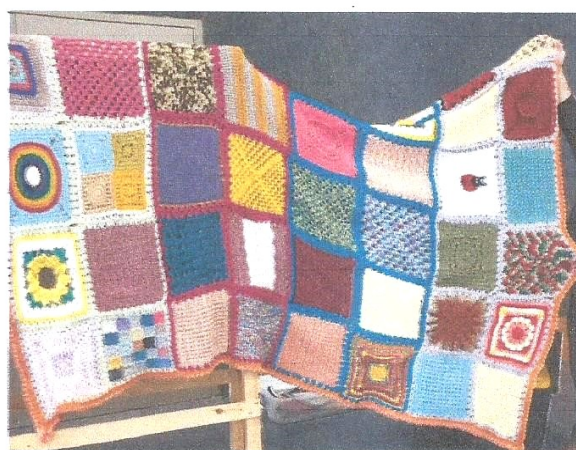
2nd Place - Queen