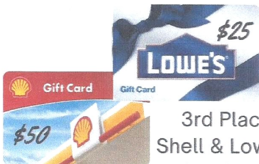
3rd Place Shell & Lowe's Gift Cards