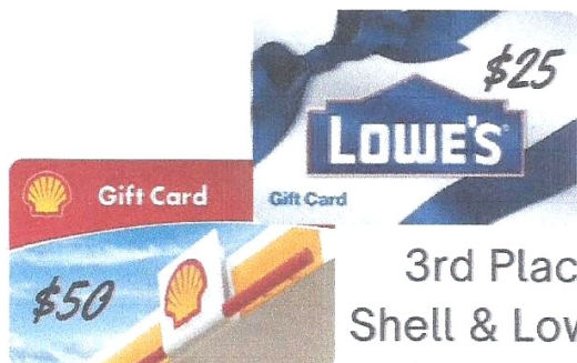
3rd Place Shell & Lowe's Gift Cards