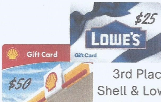
3rd Place Shell & Lowe's Gift Cards