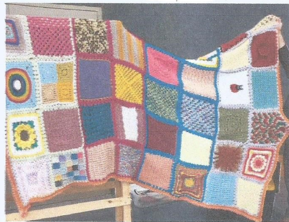
2nd Place - Queen