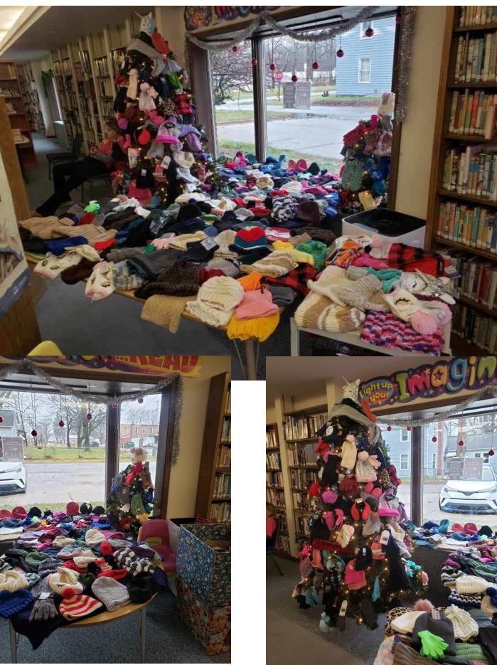
A SUPER GROUP OF KIDS!!