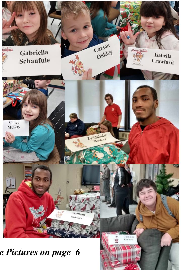
More Pictures on page 6