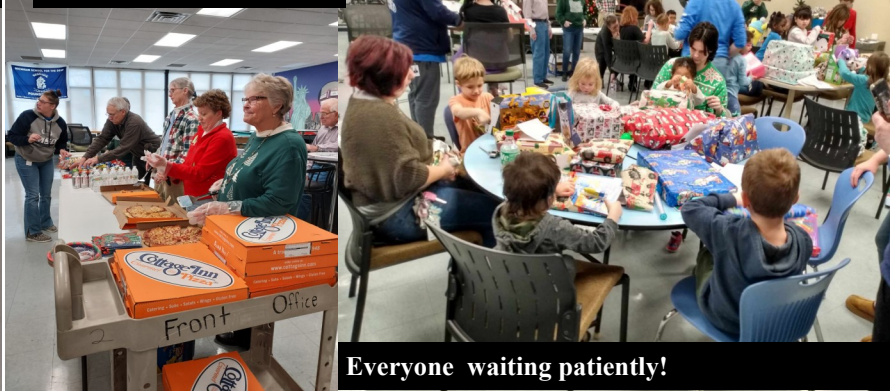
Everyone waiting patiently!

“Wright it on your heart that every day is the best day in the year” —Ralph Waldo Emerson