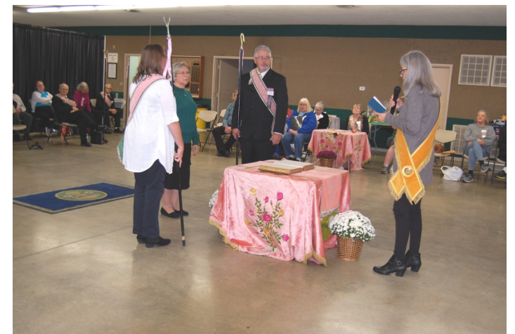
INSTALLATION OF OFFICER