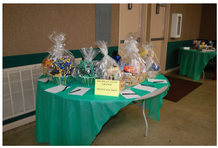
- Michigan Grange News 3