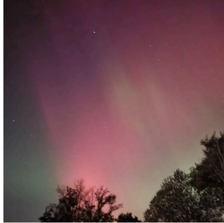
The Northern Lights appeared the 2nd time this year in Hinckley, Ohio.

Thank you to everyone who participated in the survey.