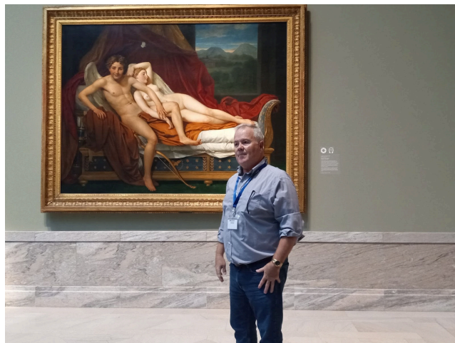
Cleveland Museum of Art November 23rd, 2024