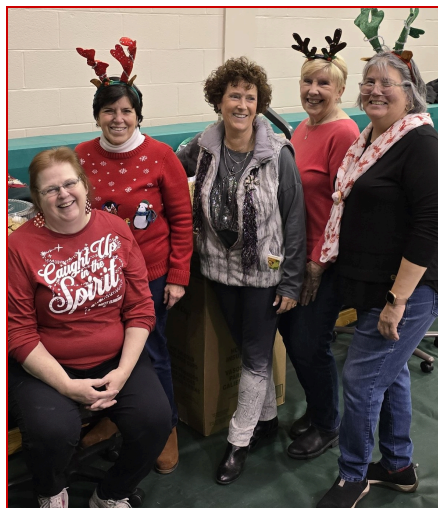
Smiles after a long day!