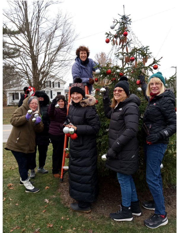
Group shot of decorating the tree