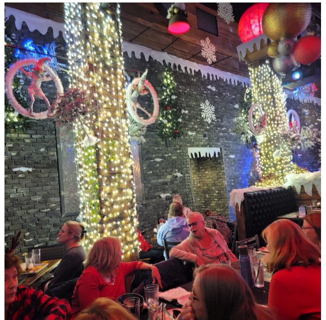
A magical time was had by all...