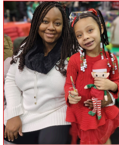
The very first Bingo winner and her mom.

These were the prizes for the Holiday Kids Bingo winners. Inside the envelopes were $10 Target gift cards, supplied from the mini raffle at the beginning of the year.