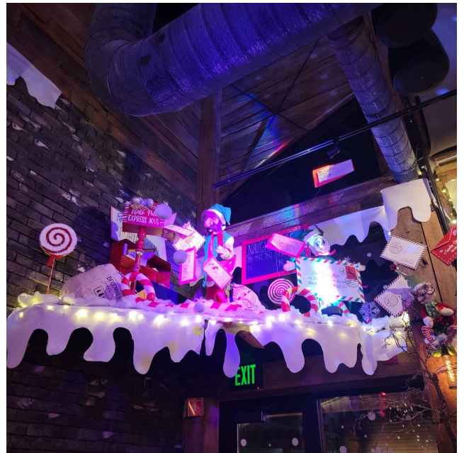
All around the Brew Garden are these mini displays, much like you would see at the old Higbee building windows at Christmas-time.