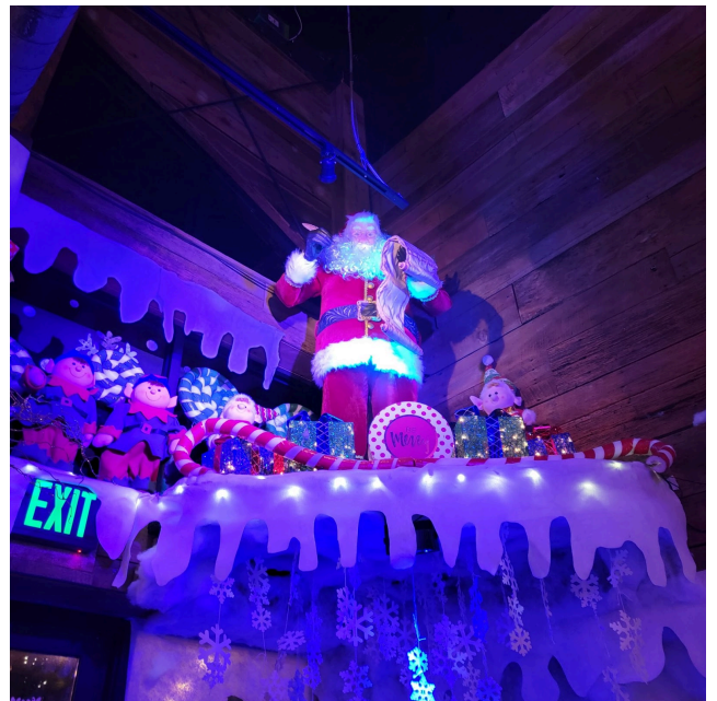
More of the “window views” in the Brew Garden.